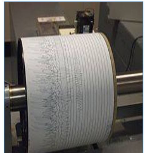
Recording of seismic noise at Weston Observatory

London, July 31: The lack of human activity during the current pandemic has led to a reduction in human-linked vibrations in Earth by an average of 50% between March and May 2020. Seismic noise is caused by vibrations within the Earth. They can be triggered not only by earthquakes, volcanoes, and bombs but also by human activity like travel and running of industries. A recent global study by geoscientists revealed that seismic noise by humans has witnessed a drop both in densely populated areas, such as Singapore and New York City and remote areas like Germany's Black Forest and Rundu in Namibia. They gathered data from 268 seismic stations in 117 countries by using seismometers (specialized devices that record ground motions, also seismic noise). This lockdown silence has helped them differentiate between human caused noise and natural signals that might warn of upcoming natural disasters. As a result, the scientists are now calling this the longest and most pronounced quiet period of seismic noise in recorded history.