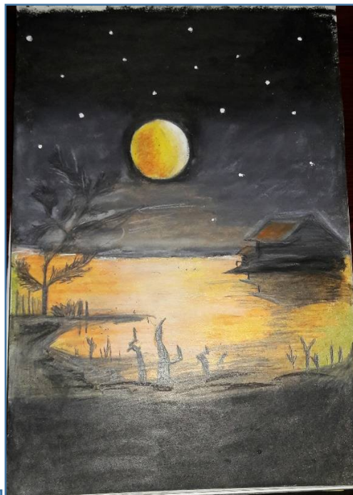
By Shivam Dubey