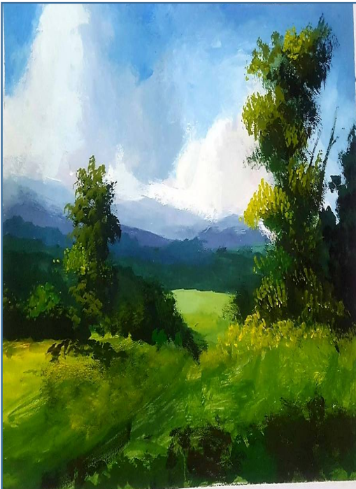
By Anushka Thodupunuri