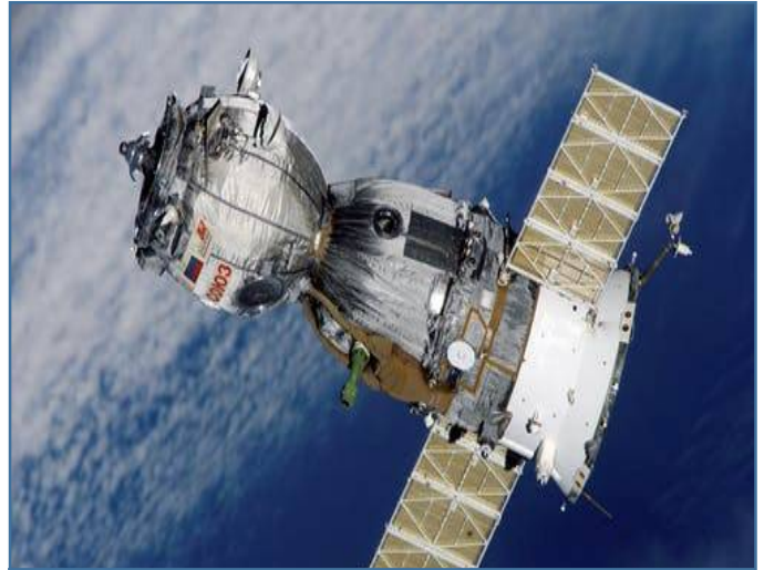
For Representation only

Hunan province, July 31: China announced last week that it was ready with its locally developed BeiDou navigation satellite system for use by countries across the world. This system will be a direct competition to US's Global Positioning System (GPS), Russia's GLONASS, and the European Union's Galileo. More than 100 countries are already using the system. The project to develop an indigenous navigation system was on since the 1990s in China and comprised over 300,000 scientists, engineers and technicians from more than 400 domestic institutes and universities. This project was commissioned by China in order to reduce its dependency on foreign technology – primarily the US's GPS.